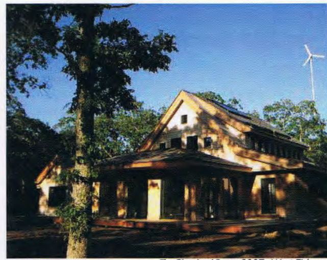
The Cleveland Farm, 2007, West Tisbury,