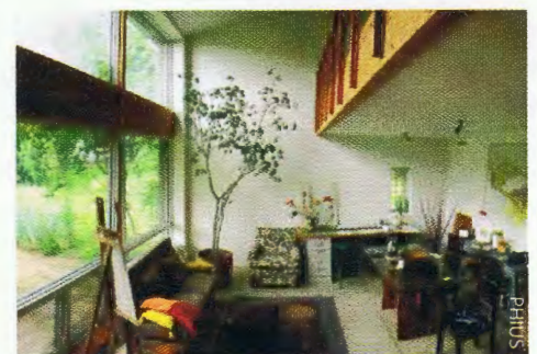
Smith House, 2003, Urbana, IL