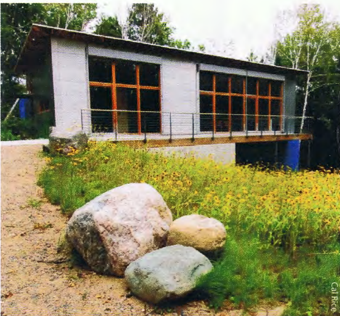
Waldsee BioHaus, 2006, Bemidji, MN