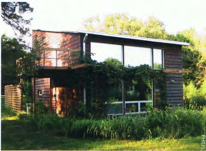
Smith House, 2003, Urbana, IL