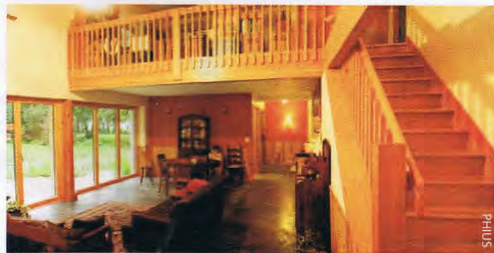
Stanton House, 2009, Urbana, IL

It is a part of the Passive House philosophy that efficient technologies are also used to minimize the other sources of energy consumption in the building, notably electricity for household appliances.